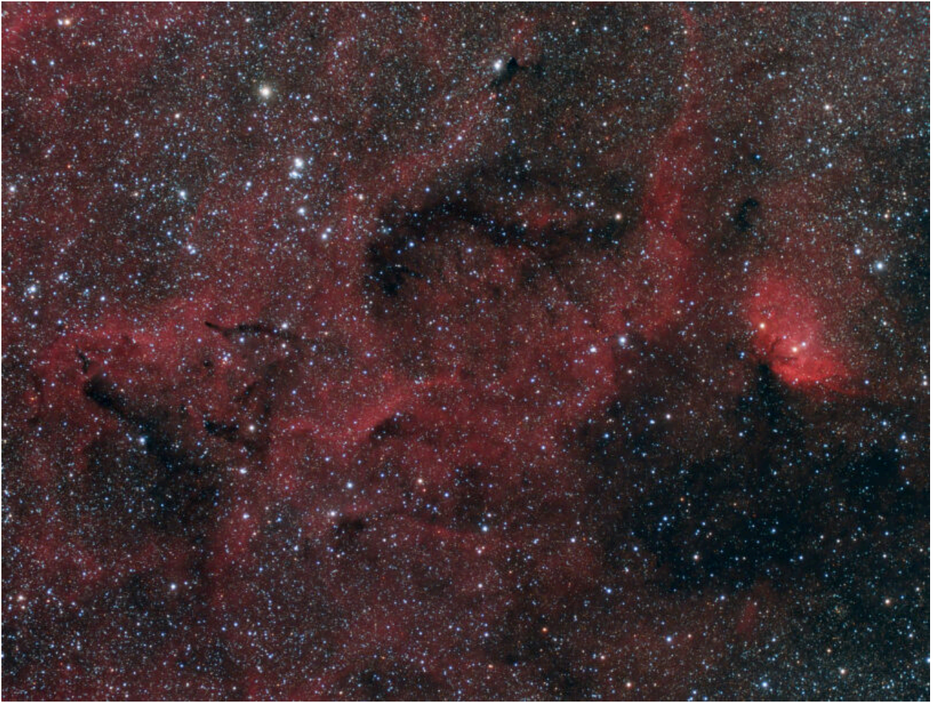
LBN 174 (telescopio/telescope #1 and #2) composizione/composition (80% H\alpha +20%R)GB - 02/10/2022