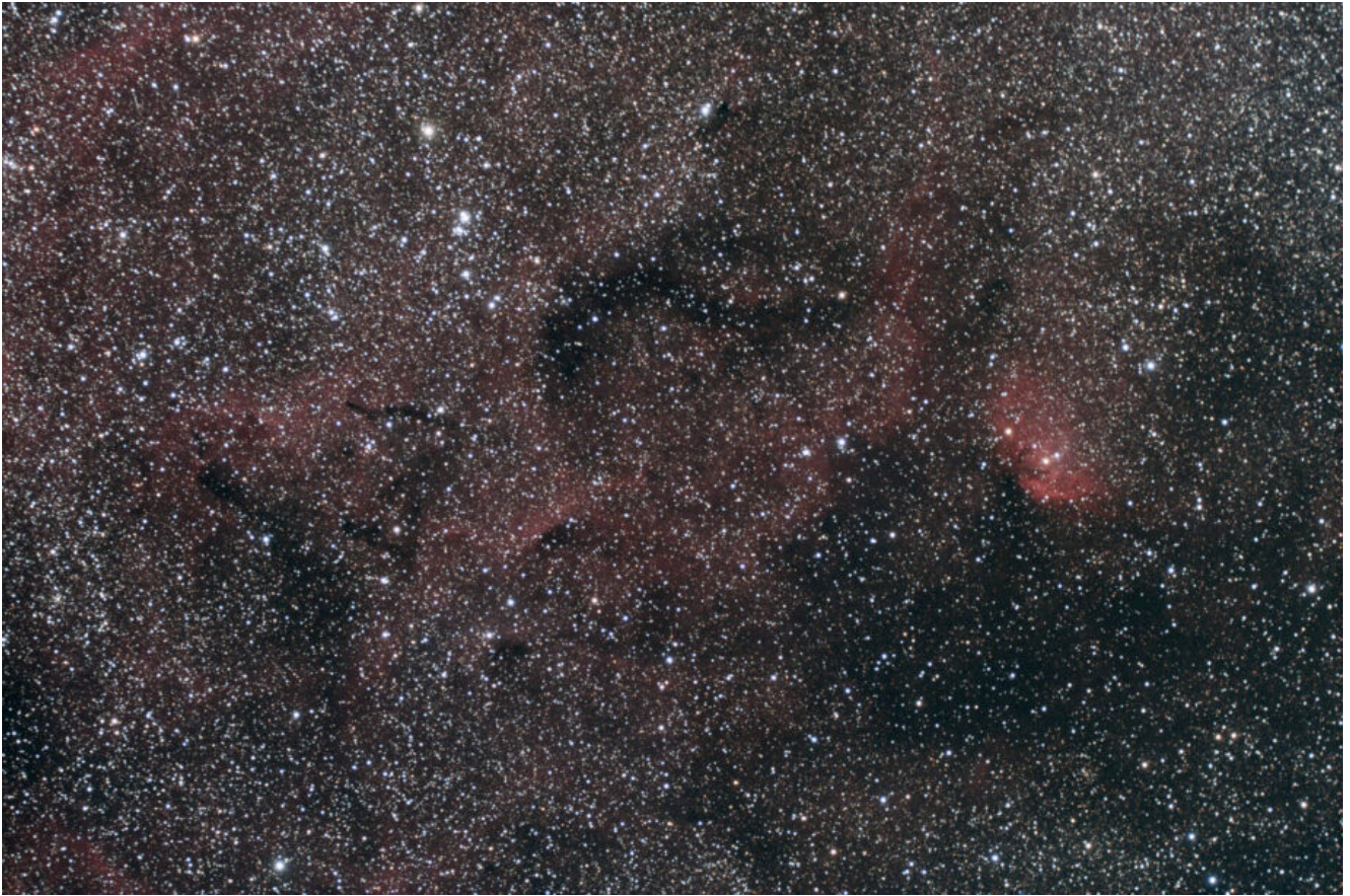
LBN 174 (telescopio/telescope #2) – 02/10/2022