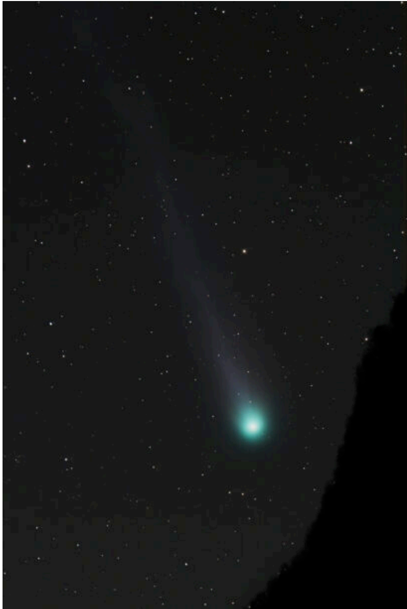
12P/Pons-Brooks con paesaggio (with landscape) – 16/03/2024