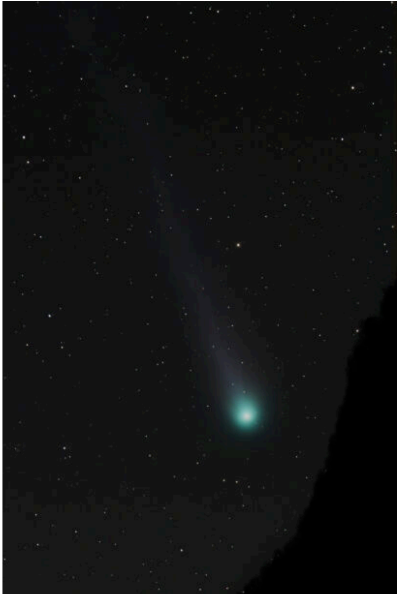
12P/Pons-Brooks con paesaggio (with landscape) – 16/03/2024

riportiamo anche una versione a luminosità più alta per la visione da smartphone (a smartphone version is also reported):