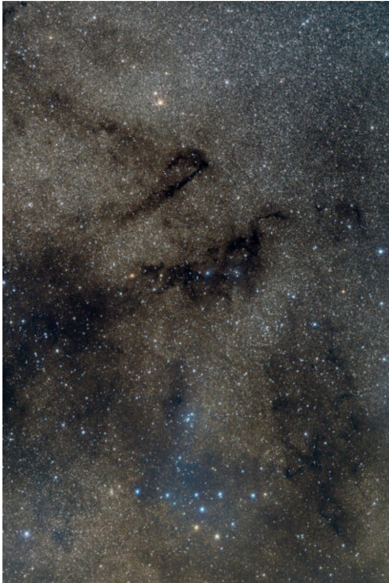
Cr 399 – 15/08/2023